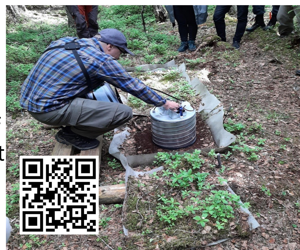
Lettosuo, Finland

ALFAwetlands 2022-2026, Wetland restoration for the future ( www.alfawetlands.eu ) is coordinated by Natural Resources Institute Finland, Luke and carried out at local to EU levels with 15 partners across Europe. The goal of ALFAwetlands is to improve the geospatial knowledge base of wetlands, to evaluate the pathways of wetland restoration that incorporate a co-creation process and to provide information and indicators for sustainability to maximise climate change mitigation, biodiversity and other benefits.