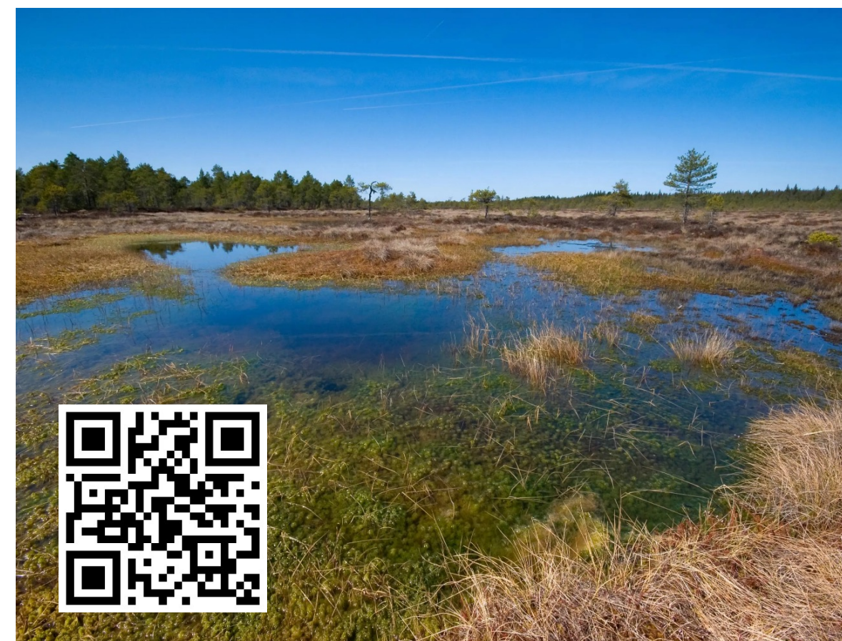
Torransuo, Finland

WET HORIZONS 2022-2026 ( www.wethorizons.eu ) is coordinated by Aarhus University, Denmark and has 14 partners around Europe. It will improve wetland restoration through a holistic approach, increasing key knowledge and developing tools to support faster large-scale action. The project will improve data from pristine, drained, and rewetted peatlands, floodplains and coastal wetlands, model common restoration measures under varying conditions, and assess socioeconomic impacts, delivering guidelines and best management practices.