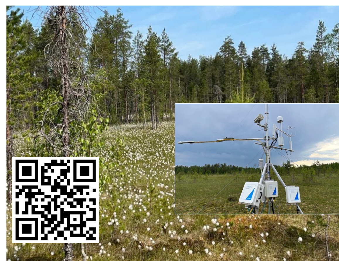
Ylpässuo, Finland

REWET 2022-2026, Sustainable restoration and conservation of terrestrial wetlands ( www.rewet-he.eu ) is coordinated by Idener, Spain. The aim of the project is to facilitate sustainable restoration and conservation of terrestrial wetlands, including freshwater wetlands, peatlands, and floodplains, by applying fit-for-purpose technologies to monitor greenhouse gas emissions, biodiversity, meteorological events and social aspects of sustainability.